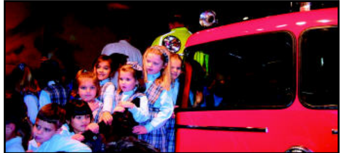
School group touring museum meet New York Firefighter

In Fiscal 2002 (ending 6/30/02), almost 22,000 children took guided tours provided by specially trained Fire Department educators. This summer, day care and summer